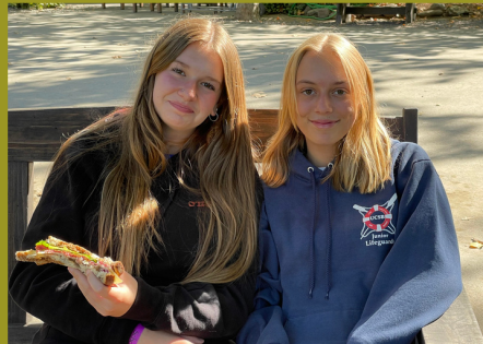
The 3rd and 8th classes took a buddy field trip to Safari West.