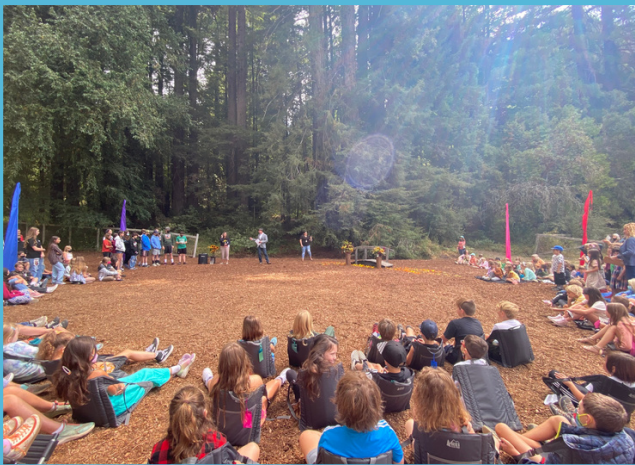
A whole-school gathering to welcome students back on campus