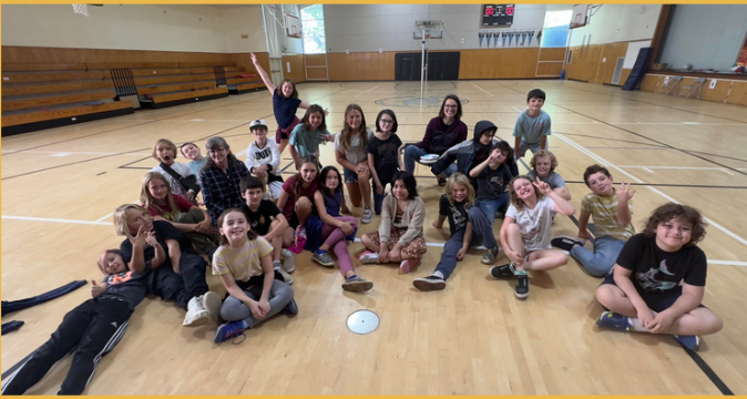
And the TK students keep busy with imaginative play!