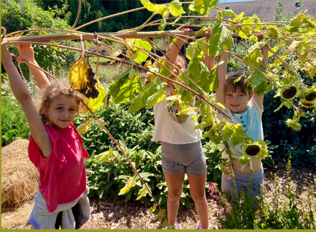
Students enjoy the sunflowers in the school garden!