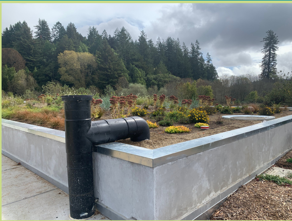
Salmon Creek water cistern and living roof